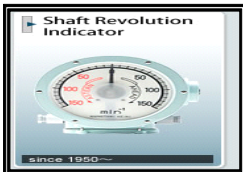
Propeller Shaft & Rudder Angle Indicator