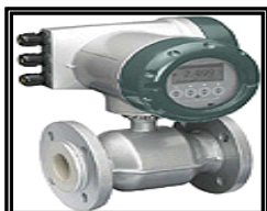
Tank Level Gauge