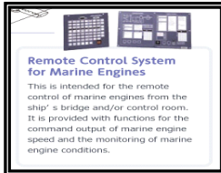
Pneumatic Control System