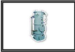
Oil Discharge Equipment